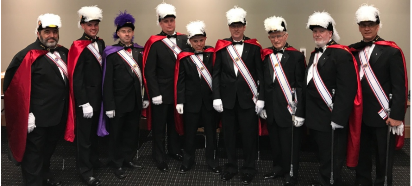
First Communion Honor Guard, May 13