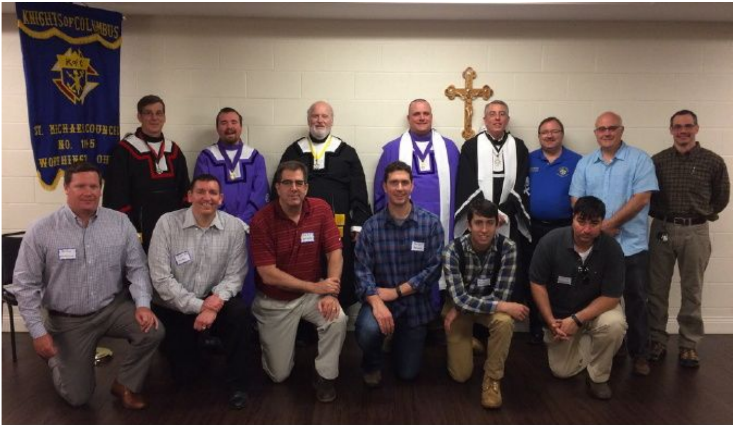
New members of KofC11445 (front row) Inducted at St. Michael First Degree Ceremony on April 17 (see names on Membership page – p. 9)