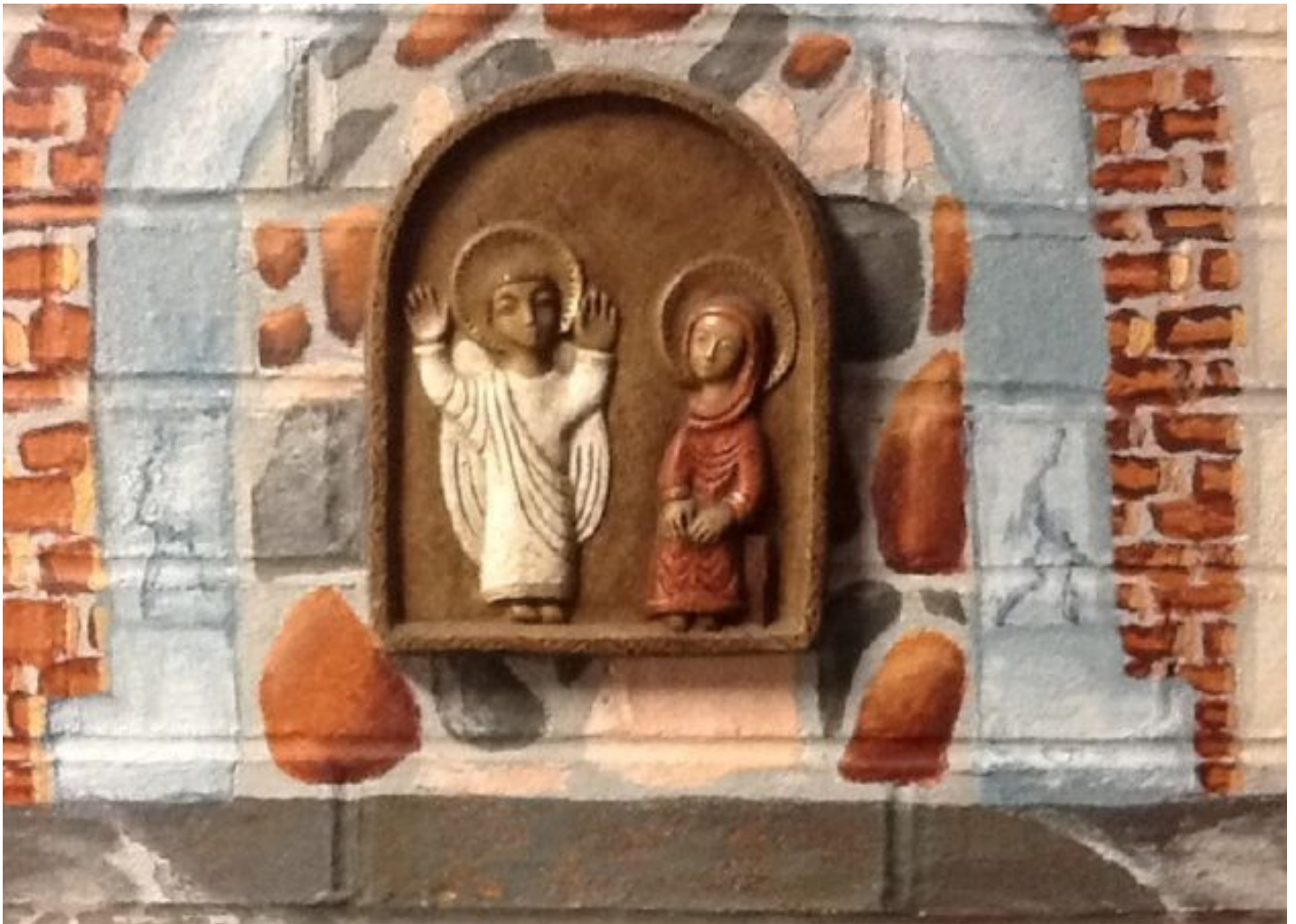
Stone Mural of Mary and Joseph at St. Michael School

Mary, the Mother of God is a light that shows a path to the Son of God. From the moment of Mary’s conception to her assumption into heaven, she stayed faithful to God. Mary conceived the Savior of the world at the Annunciation by her Faith in God. Lastly, as the Star of the Sea, Mary will be there to comfort us in the mess of today’s world. The Mother of God will shine as a lighthouse for her Son Jesus, until He comes again.