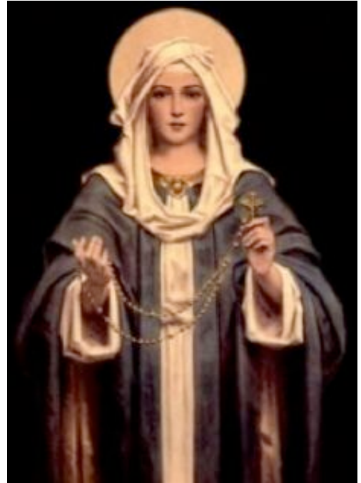
Mary, Queen of the Rosary